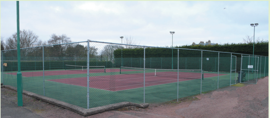
All-weather courts. Suitable for play in any kind of weather