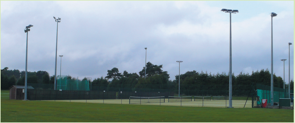
Green courts. For those who prefer playing on a lawn tennis court.