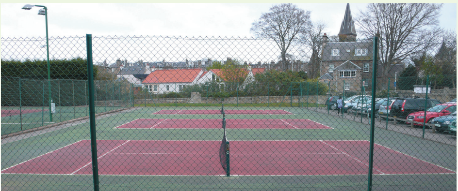
Junior courts. Smaller sized all-weather courts for younger players